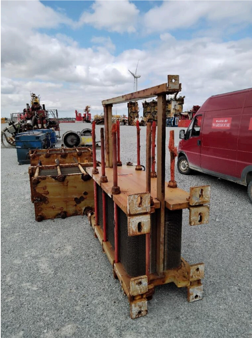
Plate Heat Exchanger